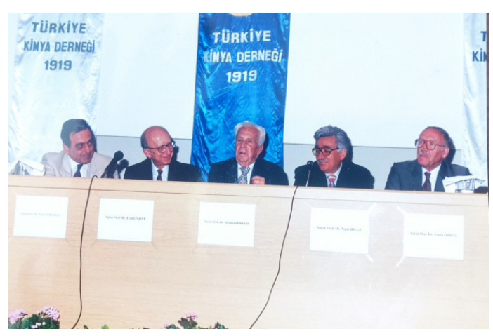
P.10: Old meetng, 1997

The first 13 issues were published under the name "Chemist" (1932-1937), followed by the same volume and issue numbers, but were different in terms of content and management, continued under the name "Kimya Annali" (1937-1939) and 6 issues were published under this name. and finally, "Chemistry and Industry" Magazine, which continued its publication life starting from its 21st issue in 1950, 11 years after the last issue of this magazine, It was published in April 2010 with its 231st issue, and 8 issues were published as an e-Journal between October 2014 and October 2016, but could not be published after this date due to various problems. [2] The Society has three peer-reviewed, scientific, and open access journals currently in publication. These are as follows: Journal of the Turkish Chemical Society, Section A: Chemistry, Journal of the Turkish Chemical Society, Section B: Chemical Engineering, and Journal of the Turkish Chemical Society, Section C: Chemical Education. These journals can be accessed from their own websites and from the "Journals" section on the home page of the Society's official website at www. turchemsoc.org.