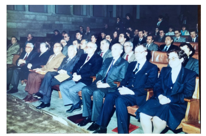
P.9: Old meeting, 1988

EuChemS Europe in 2014. Internationally important events such as the Chemistry Congress and the MACRO 2016 (World Polymer Congress), the International EastWest Chemistry Conference every year since 2017, the 20th EuroAnalysis (European Analytical Chemistry Congress) in 2019 and the 19th Asian Chemistry Congress on 09-14 July 2023.